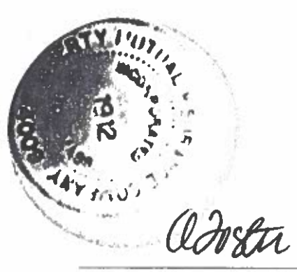
Signature of Attorney-in-Fact